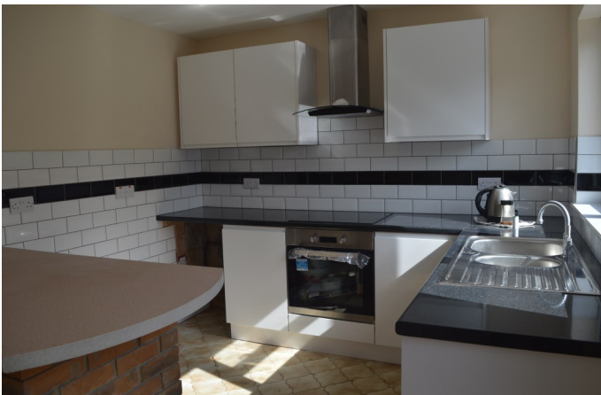
E & C Estates: are proud to present this Lovely 4 bedroom Semi Detached House.